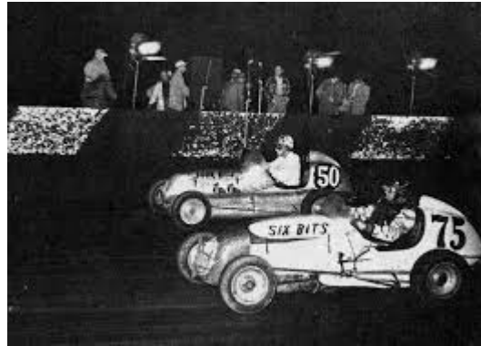
Rooney, in #50 'Four Bits', 'races' outside his teammate in #75, 'Six Bits', in the 1949 MGM film, 'The Big Wheel'.